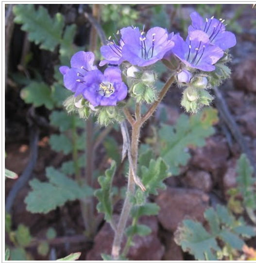
It grows along roadsides and in desert flats and washes. It has violet, bell shaped flowers with five rounded petals.