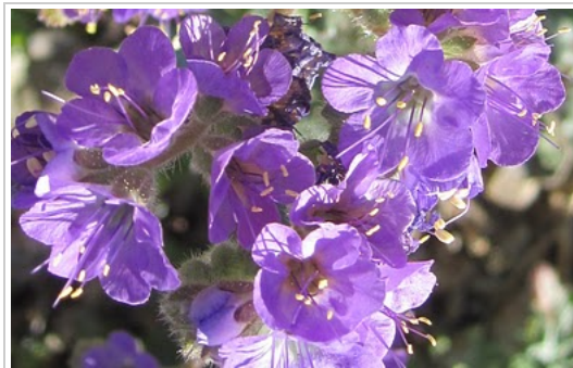
It can create a rash similar to that of poison oak which can be treated with calamine lotion and benedryl.