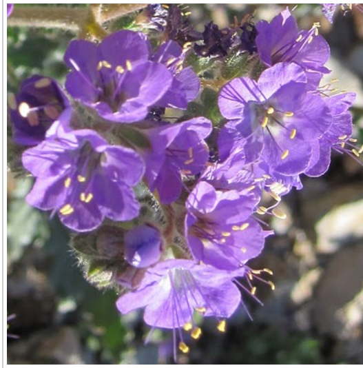
It blooms between February and May.