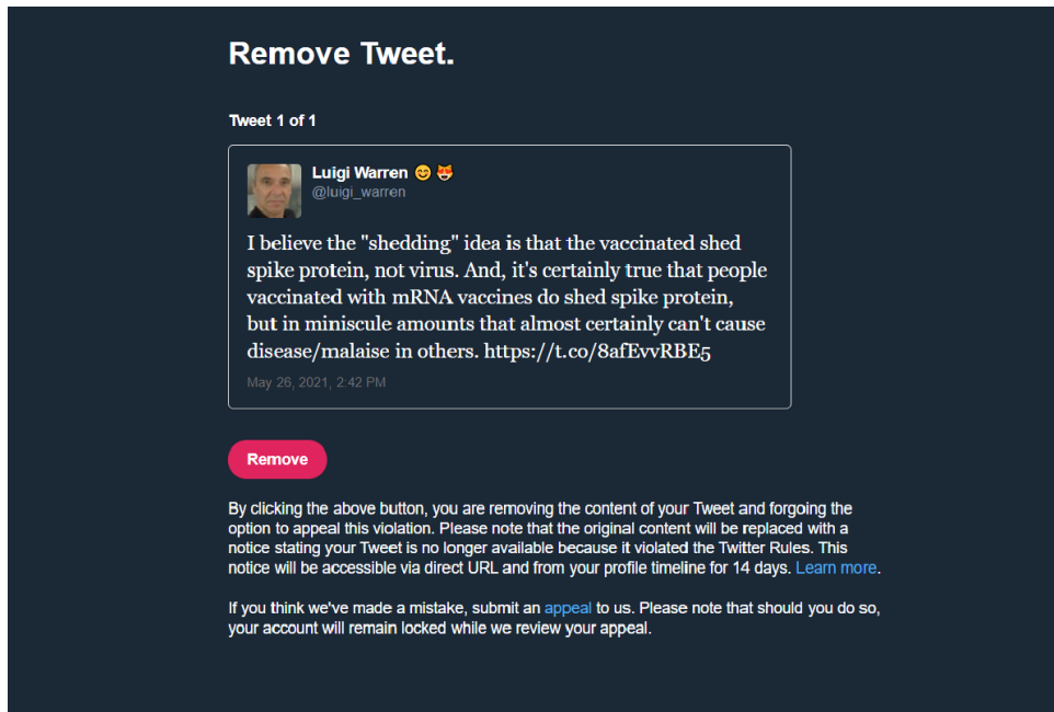
Luigi's tweet flagged for violating Twitter Rules

In short, Luigi is one of the pioneers of the prevalent applications of mRNA technology, possibly including the Covid-19 vaccine. Twitter deleting his post on the grounds of fake information seems to be a bit far-fetched move in disguise of a fact check.