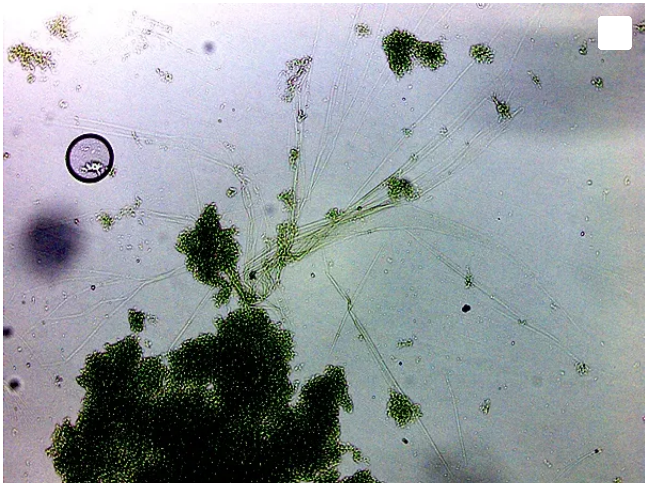
Human Blood Sample Subjected to AC Voltammetry Electrochemistry CDB Presence & Filament Formation is Evident Magnification ~ 1500x.

I have drawn many parallels in what we are seeing now with the synthetic biology since the C19 shots era and the historical research of Clifford Carnicom. He wrote a series of six scientific papers that I find highly important to consider for anyone seriously investigating what is happening to human blood since the roll out of the C19 injections and how this