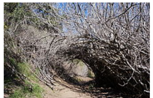
The Trail to Holy Jim Falls