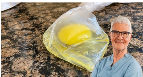
How To Empty Your Bowels Every Morning - Top Surgeon Explains How

The last time I had this happen I was sitting on a beach in Big Sur, California with a friend. We were watching the sunset, all was peaceful and I closed my eyes for a second when suddenly a shift happened in my brain, like a switch being turned on. There was no energy going up the spine, no warning sign of any kind, just a sudden explosion in my brain with the rush upward and the opening of a doorway at the top of my head into another world. For the last time I blocked it and refused to leave. It never happened again because I closed that door permanently.