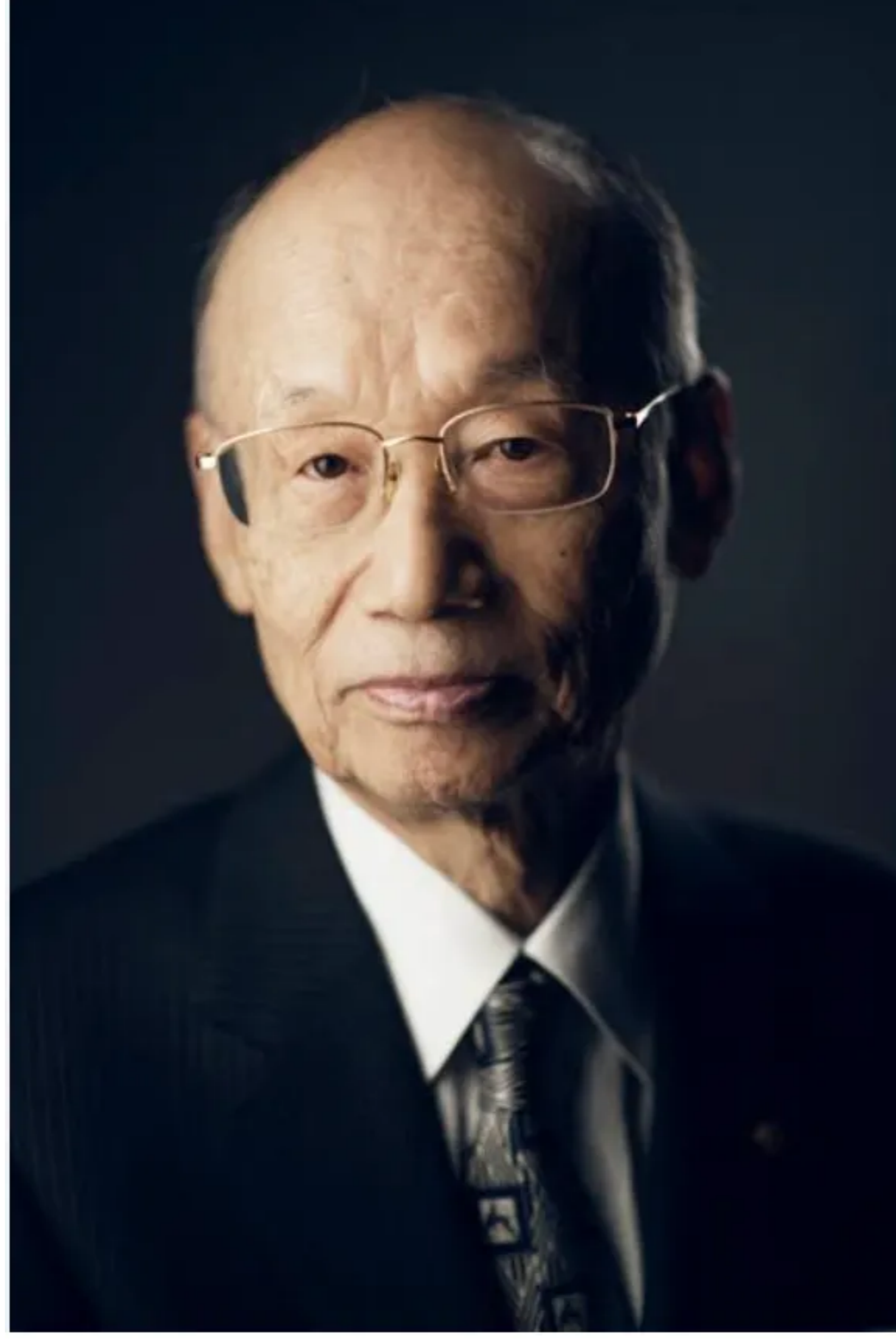
Satoshi Ōmura, discoverer of Streptomyces avermectinius, winner of the Nobel Prize in Medicine 2015.

Researching our book— The Courage to Face COVID-19: Preventing Hospitalization and Death While Battling the Bio-Pharmaceutical Complex —was often a distressing and maddening experience. The systematic lying about hydroxychloroquine to suppress its use in the outpatient setting was infuriating. However, for me, the most upsetting stories were about people who died in hospital after being systematically denied ivermectin. The sheer brutality of hospital chiefs and their attorneys, who fought tooth and nail against the administration of ivermectin to dying patients, must surely be the most morally repugnant story in modern medical history.