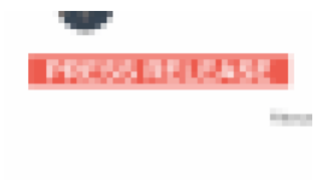
Selected Articles: Pandemic Revelations 18 February 2021