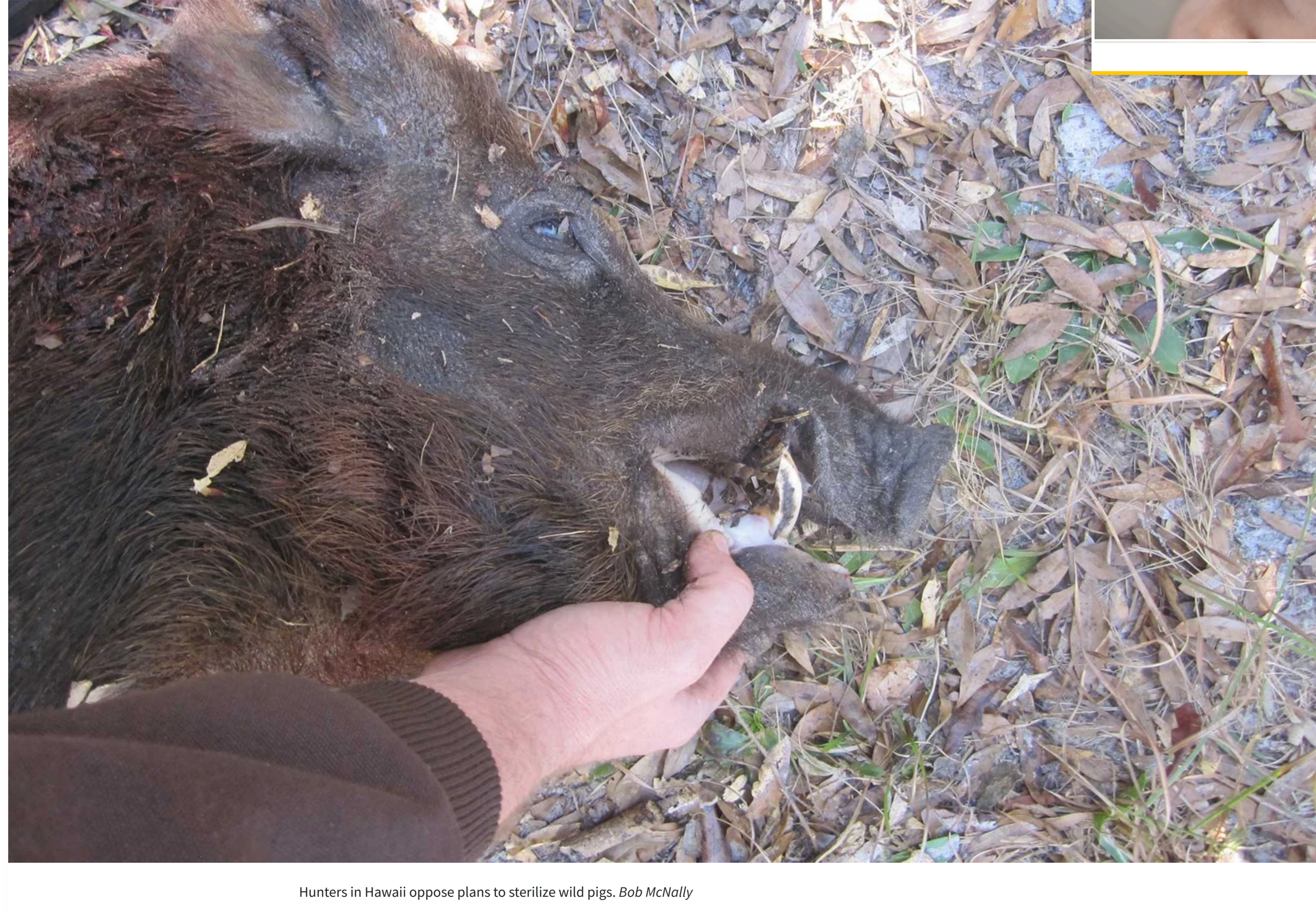
Hunters in Hawaii oppose plans to sterilize wild pigs.