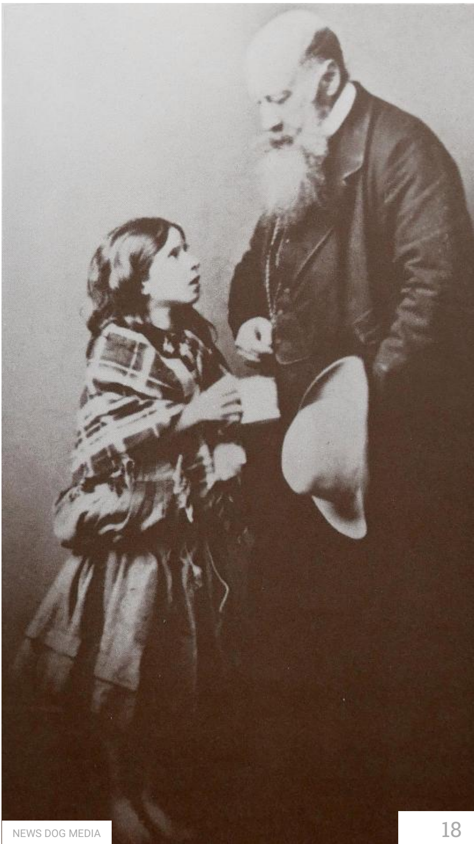
A beggar girl accompanies a much older man in a snapshot taken during a period when child prostitution was commonplace