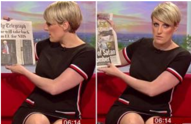
MORNING FLASH Steph McGovern accidentally exposes underwear to the nation during BBC Breakfast