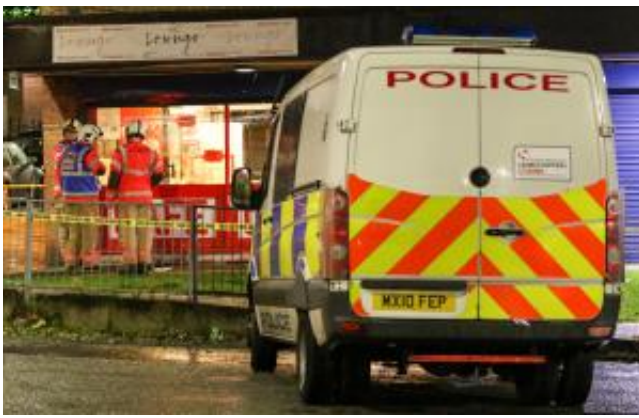
CRUDE CAFÉ BOMB Massive explosion heard across Manchester was a 'NAIL BOMB' planted outside a café