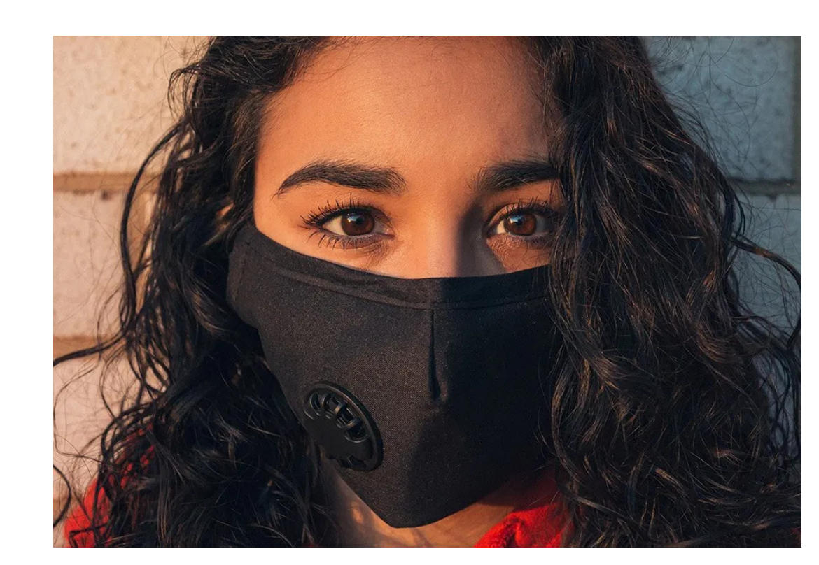
END MASK USE MANDATE

statistical chance of dying from Covid-19.