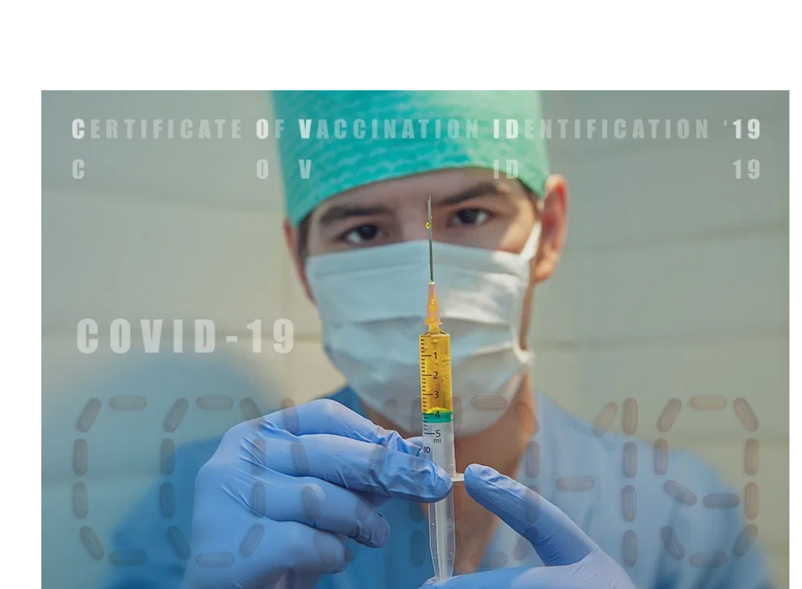
RIGHT TO REFUSE VACCINES PETITION

"The world today has about 6.8 billion people. That's heading up to about nine billion. Now if we do a really great job on new vaccines, health care, and reproductive health services, we could lower the population by perhaps 10 or 15 percent."