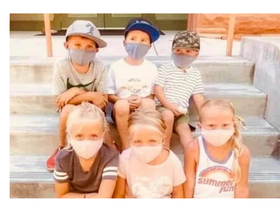
UNMASK OUR KEIKI