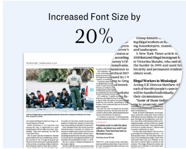
Easier to Read