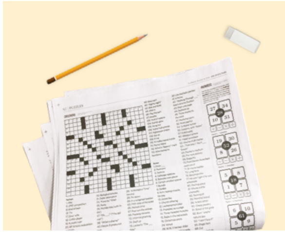
Engaging Crosswords and Puzzles