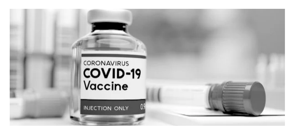
This Week's Most Popular Articles Oct 20, 2022