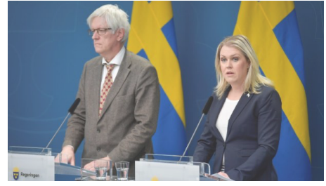
Sweden Says PCR Tests "Cannot be Used to Determine Whether Someone Is Contagious" 24 May 2021