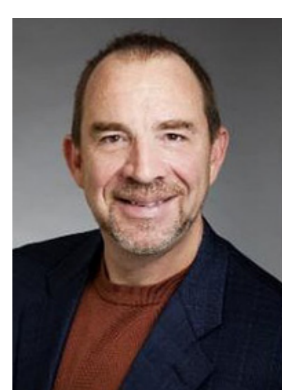
The Late Walter Crinnon