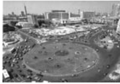
Tahrir Square, site of Egypt’s revolution, with and without protesters.