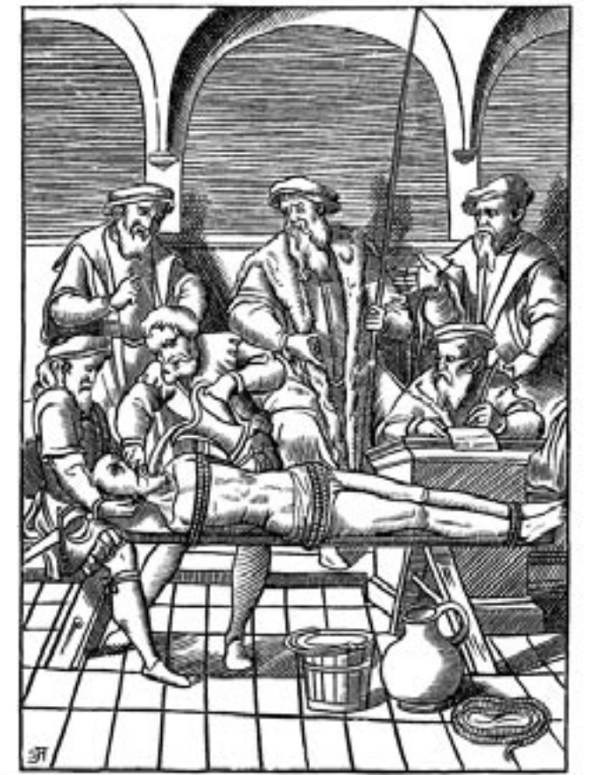
Fig. 341.—The Water Torture.—Fac-simile of a Woodcut in J. Dambouille's "Praxis Iurum Criminum;" in 4to, Antwerp, 1596.