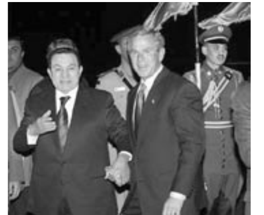
For Bush future travel will be restricted to undemocratic client states such as Saudi Arabia... even post-revolution Egypt may now be off the Bush itinerary.

We in the IndictBushNow movement are committed to ensure that Bush will be pursued wherever he goes for his war crimes, torture policies and attacks on civil rights and civil liberties. We demand justice.