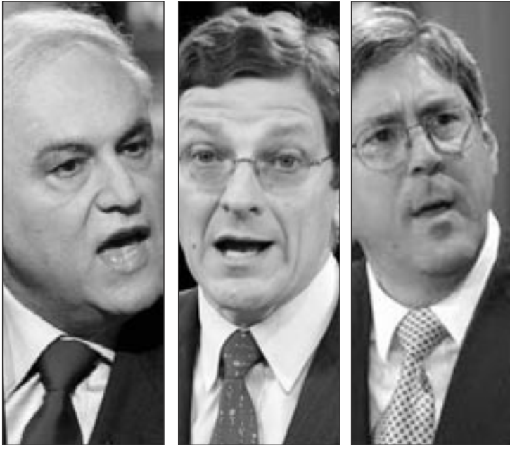
Richard Perle Marc Grossman Doug Feith