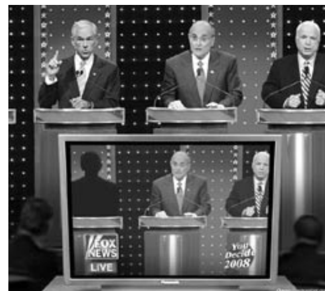
Fox News has a history of slighting Ron Paul as illustrated in this satirical graphic from 2008.