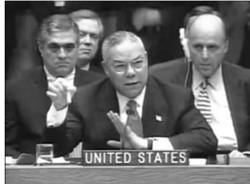
George Tenet, Colin Powell and John Negroponte

know that Saddam's son, Qusay, ordered the removal of all prohibited weapons from Saddam's numerous palace complexes.” The January 31, 2003, evaluation of Powell's draft remarks prepared for him by the State Department's Bureau of Intelligence and Research (“INR”) flagged this claim as “WEAK.”