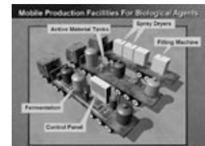
Colin Powell's Non-Existent Iraqi Mobile Biological Weapons Laboratory.

The January 31, 2003, INR evaluation flagged this claim as “WEAK” and added: “We support much of this discussion, but