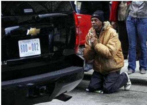
A Mundane kneels before a royal carriage bearing the Sanctified Personage of the Killer-in-Chief.

Force -- Force to the utmost; Force without stint or limit, the righteous and triumphant Force which shall make Right the law of the world and cast every selfish dominion down in the dust.