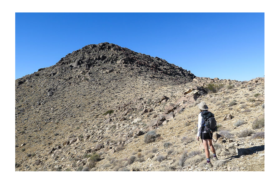
Monument Mountain summit - 4, 834 feet