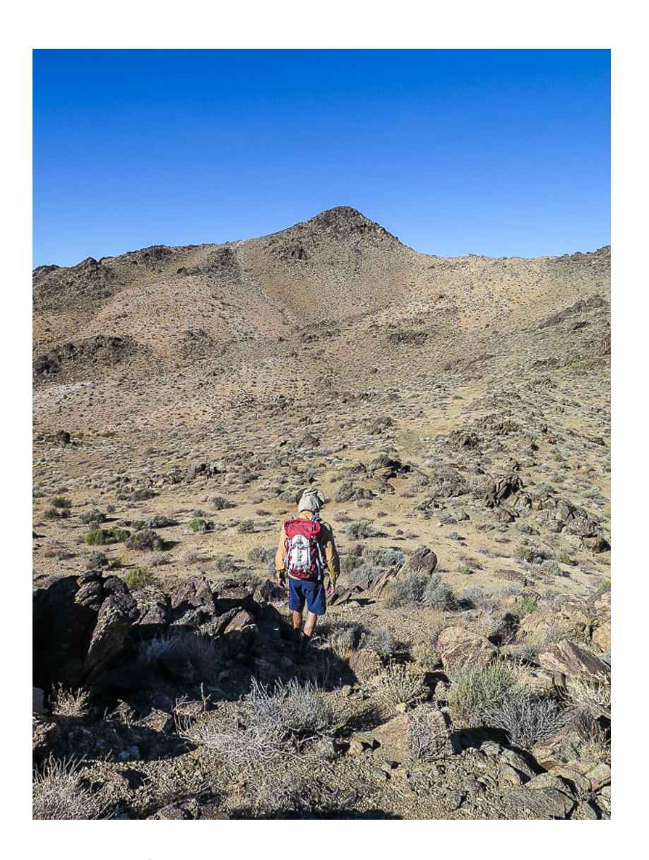
Looking at Monument Mountain summit

About 2/3 of hike distance, Monument Mountain finally comes into view. You can see faint trail leading up to the ridge after descending slightly down from the ridge into a broad sloping valley on your left and a saddle to your right. The climb up the stable metamorphic rocks to the summit is relatively easy.