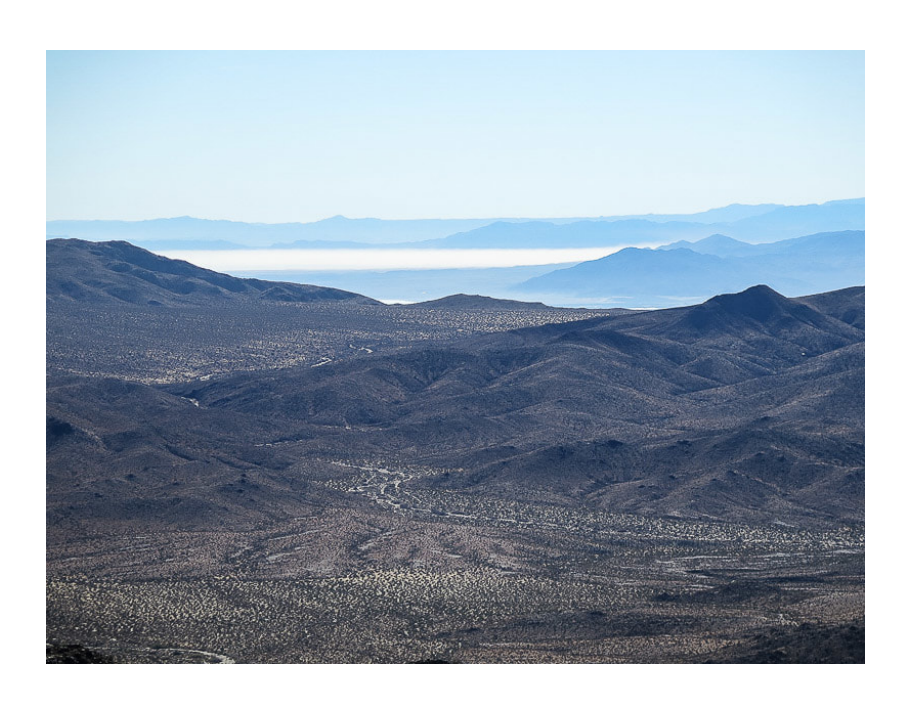
View to the southwest of the Salton Sea from the summit