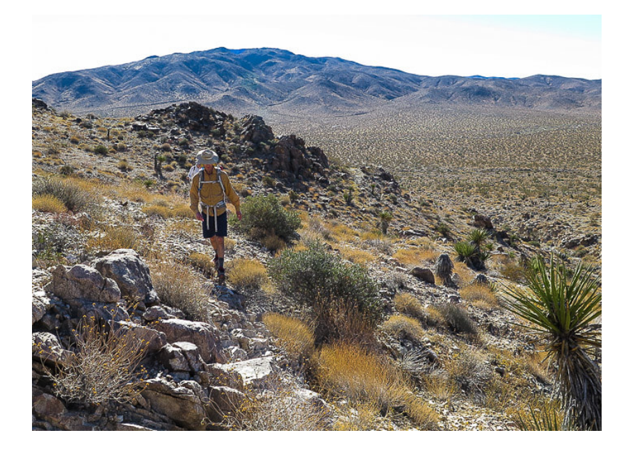
Fred ascending to ridge from Pinkham Canyon Road in valley below

writing, Linda tells the story of her unique mother's life; including beautiful photographs