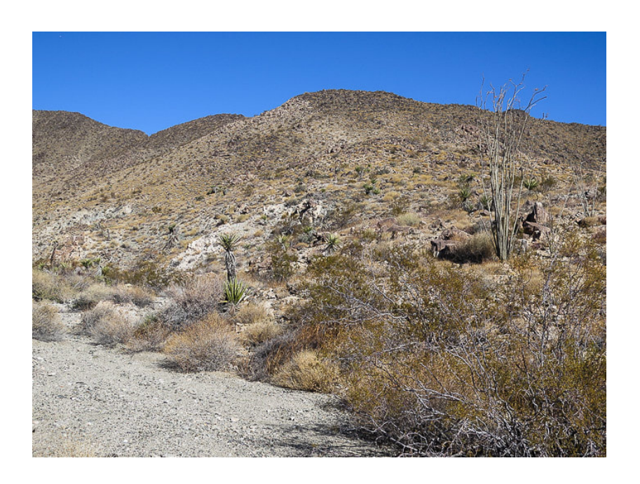
From edge of wash, climb up first hill to the south ridge of Monument Mountain

As you look north, you see a rise and it is best to get to the top of it and onto the ridge that will take you to the top of Monument Mountain. The trail on top of the ridge is faint and marked at somewhat regular intervals with small cairns. Once on the ridge, the route is a gentle rolling climb to the summit cone of rocks with washes on both sides. Some dry washes have deep rock cuts at the top.